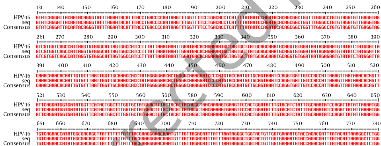
Figure 2. HPV-16 Multiple Sequence Alignment